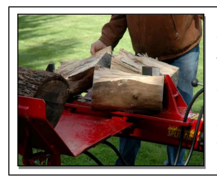
Split-Fire wood splitters require much less power to split wood while offering much greater operator safety. Split-Fire wood splitters are built to a quality and finish, with clean welds, seldom found in the wood splitter industry. For more than 27 years Split-Fire has built a reputation of quality, durability and dependability!

Maintenance: All parts on these splitters are built with as many standard parts as possible. Wear pads are from standard plastic and hydraulic cylinder seals are the standard o-ring kits found in many cylinders. If the knife gets damaged, just haul out the welder and weld it up and sand back to original.